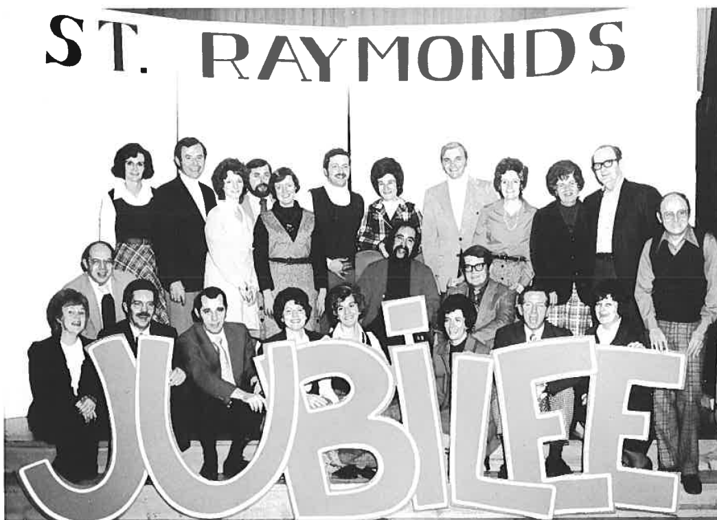
The Jubilee Players were put together in 1974 to celebrate the parish's 25 th anniversary. For two consecutive weekends the gym and school were turned into a casino/restaurant/theatre. For years afterward, the Jubilee Players provided the parish with an annual musical, play or revue.