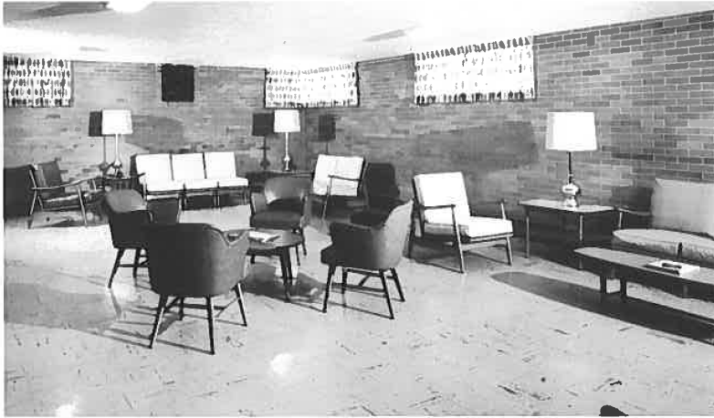
The convent was built at the corner of Milburn and I-Oka Avenues for members of the Sisters of Mercy who taught at the school. The chapel was located on the upper floor at the north end and the basement was furnished as a recreation and living room.