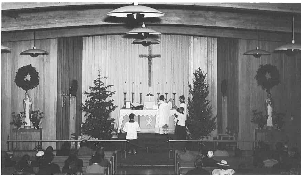
The little church was especially lovely at Christmastime.

St. Raymond Sisters of Mercy get their students ready for polio shots in 1955.