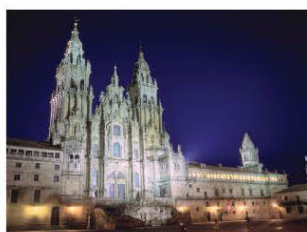
Santiago de Compostela