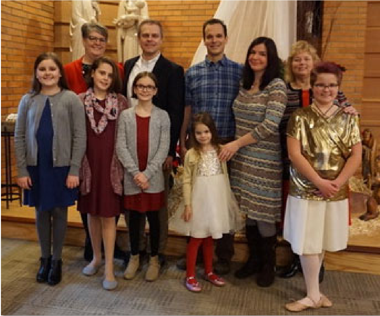
The Zajac Family The Ziegenhorn Family The Gross Family