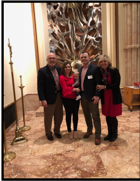
This year's St. Raymond candidate and family at Holy Name Cathedral after the Rite of Election.

One of the hallmarks of the Catholic Church is that we are a people-on-mission . The Good News (of God's active, loving presence in our lives ) is not ours to hoard. Rather, the Spirit of God compels us to share it! Therefore, we ask you , the Church of St. Raymond , to think of people you know (a neighbor, a co-worker, a friend) who might be at a place in their lives where they are searching for something "more." We encourage you to reach out and invite these people to consider exploring the Catholic faith here at St. Raymond's.