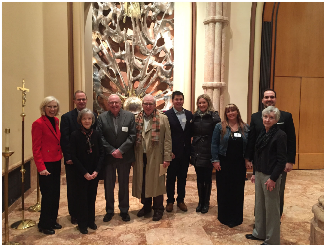
St. Raymond candidates, sponsors and some RCIA team members at Holy Name Cathedral after the Rite of Election.

One of the hallmarks of the Catholic Church is that we are a people-on-mission . The Good News (of God's active, loving presence in our lives ) is not ours to hoard. Rather, the Spirit of God compels us to share it! Therefore, we ask you , the Church of St. Raymond , to think of people you know (a neighbor, a co-worker, a friend) who might be at a place in their lives where they are searching for something "more." We encourage you to reach out and invite these people to consider exploring the Catholic faith here at St. Raymond's.