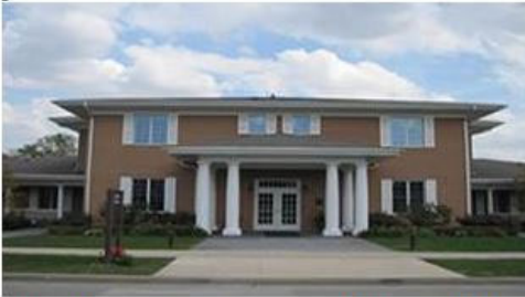
Fisher House at Edward Hines Jr. VA Hospital

The Fisher House at Edward Hines Jr. VA Hospital, Hines IL is a comfortable home where military and veterans' families can stay at no cost while their loved ones are receiving treatment at the VA medical center. The Fisher House offers 21 suites, private bedrooms, baths, a shared common kitchen, laundry facilities, a warm dining room and inviting living room. The house offers all the comforts of home while promoting a warm and supportive environment for families living through a stressful and challenging time in their lives. On-going financial support by the Fisher House Foundation ensures there is never a lodging fee and donated frequent flyer miles & hotel reward points bring family members to the bedside of their injured service members.