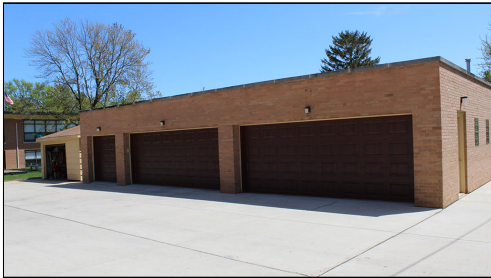
New Garage Doors in Courtyard.