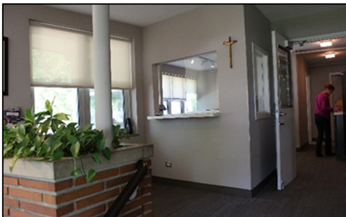
Updated PMC Reception Office.