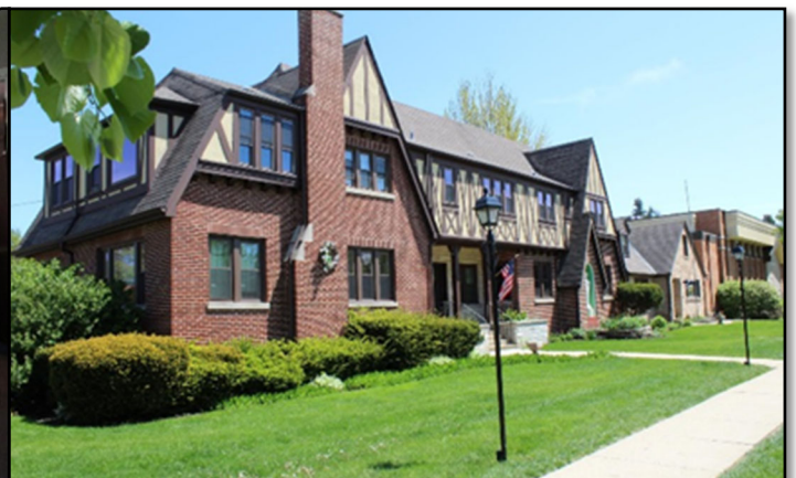
New Rectory Windows and Doors.