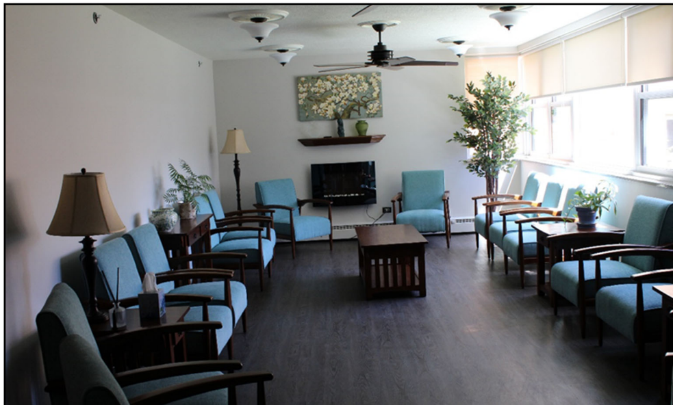
Remodeled Living Room in PMC